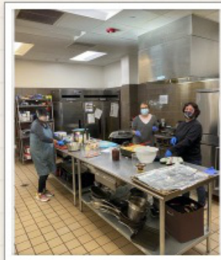
COOKING AT RM HOUSE