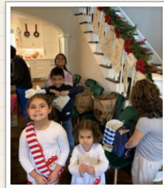
GUPTA KIDS STUFF COSMETIC BAGS