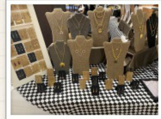
LINDIK DESIGNS AT FALL TRUNK SHOW